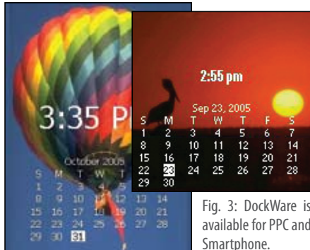
Fig. 3: DockWare is available for PPC and Smartphone.