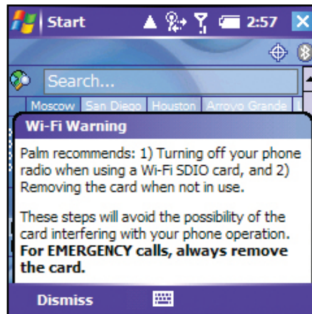
Fig. 1: When a successful Wi-Fi connection is established, it is indicated in the title bar at the top of the screen. Disable your phone when connecting to Wi-Fi to save the battery.

When you first insert the card, a blue light starts flashing on the left side of the card until it automatically makes a connection with an open network, at which point the light stays on. A successful connection is also indicated by the Wi-Fi icon in the title bar—a small radio tower with a halo at the top. When the connection is established, two arrows facing in opposite directions appear on the icon (Fig. 1). If you have a Phone Edition device, you may wish to consider disabling the phone when connecting to Wi-Fi to conserve battery power. However, it seems to work fine whether or not the phone is active.