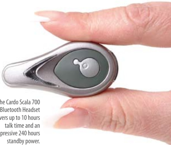
The Cardo Scala 700 Bluetooth Headset delivers up to 10 hours talk time and an impressive 240 hours standby power.

Plantronics is a well-known mobile headset brand that supplies several Bluetooth models. Their Pulsar 590A Bluetooth Stereo Headset represents a top-of-the-line stereo headset experience and the $250 SRP reflects the pedigree of its state-of-the-art Bluetooth technology. The Pulsar supplies up to 10 hours of continuous operation and a telescoping microphone for improved voice transmission quality. It collapses into a compact travel case that can also hold the included USB charger for recharging the headset's built-in battery. For those fortunate owners of advanced Windows Mobile devices that support the recent Bluetooth Advanced Audio Distribution Profile (A2DP), high-quality stereo sound can