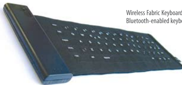
Wireless Fabric Keyboard is quite literally one of the most flexible Bluetooth-enabled keyboards available today.

Each of us can recollect the first time we encountered a person using a hands-free headset, perhaps thinking they were talking to themselves or had lost their minds. Many of us can also remember the first time we used one of these devices and experienced the feeling of liberation and mobility a hands-free headset provides. Originally, these headsets had a bothersome cable connecting them to the phone, but Bluetooth has eliminated this. Once you've experienced the freedom of a Bluetooth-enabled headset, it's nearly impossible to revert back to old fashioned wired or, perish the thought, handheld designs.