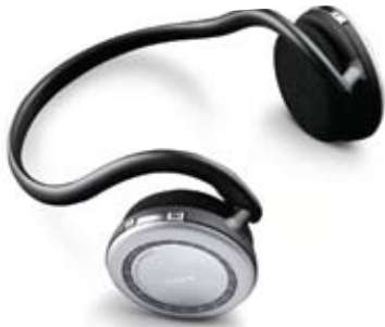
Jabra's BT620s Bluetooth Headphones deliver advanced Bluetooth technology at a relatively affordable price.

Jabra offers a less expensive stereo headset with fewer features than the Pulsar 590A. The Jabra BT620 not only offers quality stereo sound, it can operate continuously for up to 14 hours on a fully-charged battery. In addition, it has the ability to work with two Bluetooth devices at the same time; for example, a phone for communicating and a Bluetooth-enabled PC for listening to music. While I preferred the design of the Plantronics stereo headset, both it and the BT620 provided acceptable performance.