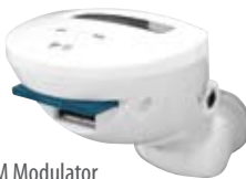
Fig. 2 (right): The head of the VRFM9 FM Modulator swivels up to expose an SD card slot and a USB port.

on your Pocket PC or portable media player. If you have a Windows Mobile device with a 2.5mm stereo jack, you’ll need to get a cable with 2.5mm plugs on each end, or 3.5-to-2.5mm adapter. These should be available at an electronics store.)