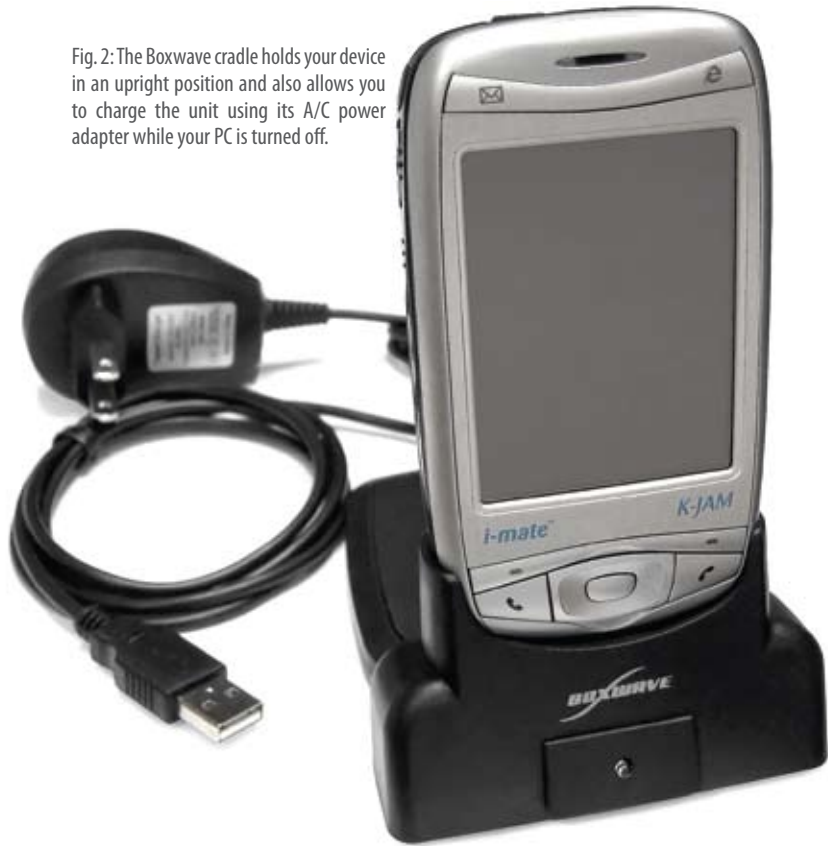
Fig. 2: The Boxwave cradle holds your device in an upright position and also allows you to charge the unit using its A/C power adapter while your PC is turned off.

Fortunately, Boxwave Corporation ( boxwave.com ) offers its Desktop Cradle for a wide variety of Windows Mobile devices, starting at $27.95. My favorite feature of the Boxwave cradle is that it includes an A/C adapter and USB cable, which means your Windows Mobile device can recharge even while your PC is turned off. And, because this unit comes with all of the required cables, you can throw your original USB cable into your suitcase so it's always available when you're on the road.