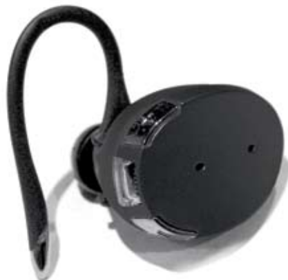
The Gennum nX6000 Delivers amazing voice transmission quality packaged in one of the smallest Bluetooth ear piece designs available today.