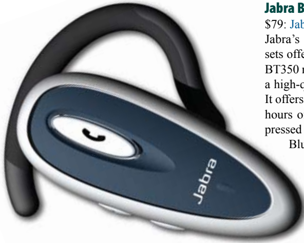
The Jabra BT350 Bluetooth Headset sports both high-quality form and function in an attractively contoured design.