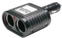
Fig. 1 (left): RoadPro 12 Volt 2 Way Accessory Adapter ($16.99) at RealTruck.com.

I don’t listen to radio stations much anymore because the ratio of songs I like to songs I can’t stand is getting rather small. Instead I buy the music I like and keep it with me on my Pocket PC. The FM Modulator makes it easier to play that music through my car’s audio system when I travel. It’s like I’m listening to the perfect radio station—no commercials and every song a personal favorite! ■