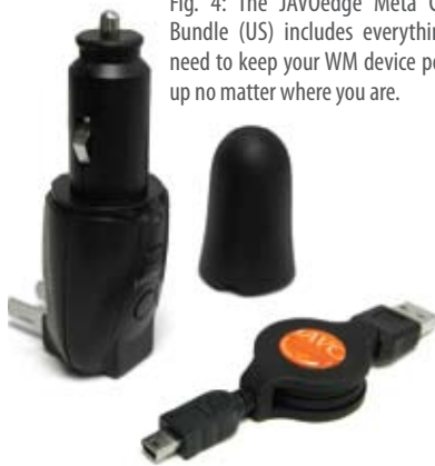
Fig. 4: The JAVOedge Meta Charger Bundle (US) includes everything you need to keep your WM device powered up no matter where you are.

The JAVOedge Meta Charger Bundle (Fig. 4) (for many, but not all, devices) is available for approximately $25 from JavoEdge. Go to the Web site and do a Quick Search on your brand and model to see if it's available.